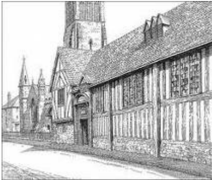
Hassenbrook has become the booming center of trade for us in Fengate.

In recent months, Hassenbrook has opened its doors and trade routes to all citizens of Fengate. Between the shipping and road routes, business is at the booming point.